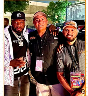
50 Cent Concert